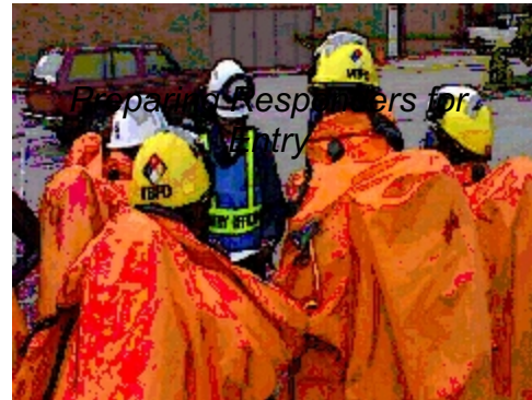
Preparing Responders for Entry

The emergency response challenge is profound. On the one hand, you have a hazardous materials or mass casualty incident. From that standpoint, you can and should use recognized protocols such as the Incident Command System (as referenced in 29 CFR 1910.120) in order to effectively respond to the needs of the victims and the public. On the other hand, the scene is compounded by two complicating factors which all responders will have to take into account 3 / 4 deliberate targeting of responders and crime scene considerations.