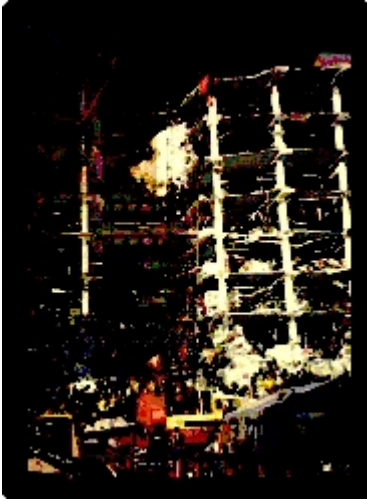
Nighttime Operations at Oklahoma City

Events such as the World Trade Center and Oklahoma City incidents, and various clinic bombings are designed to create a public atmosphere of anxiety and undermine confidence in government. Their unpredictability and apparent randomness make it virtually impossible for governments to protect all potential victims.