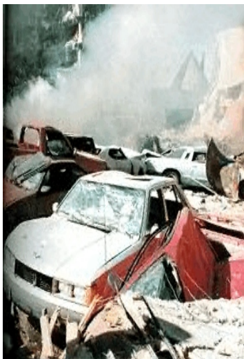
Automobiles damaged in a bombing

Terrorists have a history of utilizing secondary devices and/or booby traps to target emergency responders. In January 1997, a bomb went off outside of an Atlanta abortion clinic. One hour after the initial detonation, a second bomb went off close to the point at which the incident command post had been established. It resulted in several injuries to responders. If parked automobiles had not absorbed some of the blast, several deaths could have occurred.