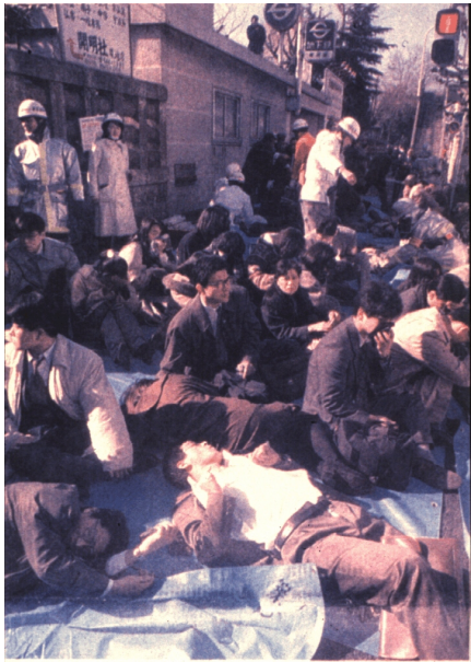
Victims of the Tokyo Subway Incident

As you can see, extremists have used property destruction and violence to generate fear and compel societal change throughout history. However, one major change has happened recently. Prior to modern times, terrorists usually granted certain categories of people (e.g., women, children, clergy, elderly, infirm, etc.) immunity from attack. Like other warriors, terrorists recognized innocents - people not involved in conflict. For example, in late nineteenth-century Russia, radicals planning the assassination of Tsar Alexander II, the leader of Russia, aborted several planned attacks because they risked harming innocent people. Historically terrorism was direct; it intended to produce a political effect through the injury or death of the victim.